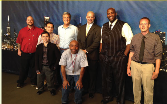
2014 photo showing the original team that helped start the PGM TV program.

Watching and hearing the stories of those who came to PGM for help also helps reveal the different aspects of life in which people struggle and can serve as living proverbs as to what to do and what not to do. Whether it is the stories being taught from the Bible or the stories of individuals who came here, the viewers of the program will learn valuable life lessons and spiritual insight. We thank those of you who have viewed and shared our PGM TV program, and we look forward to another ten years of sharing the true power of God and His son, Jesus Christ.