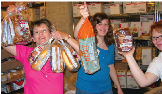
Volunteers working in PGM's food pantry.

To those who pray, donate, and volunteer to support the Mission, we extend our deepest appreciation for your generosity. Together, we serve the Lord, and together, we give thanks.