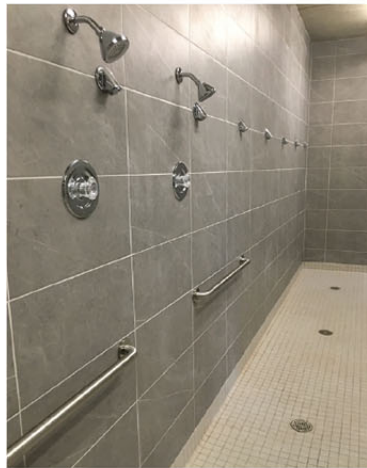
Before and After: The Women's Program shower facilities were renovated in 2023.