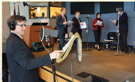
A professional, live performance of "Unshackled!"