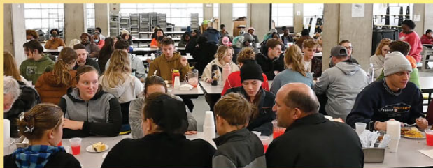
Enjoy a quality complimentary meal in our cafeteria.