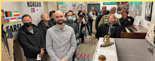
Tour guides highlight the PGM facilities.