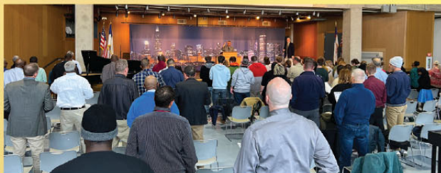
Join the celebrated Praise and Testimony Service.