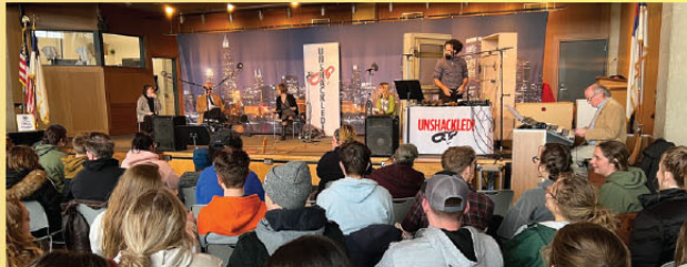
See a live recording of the famed Unshackled! program.

Visit our website at pgm.org to learn more about PGM’s multiple ministries to the needy.