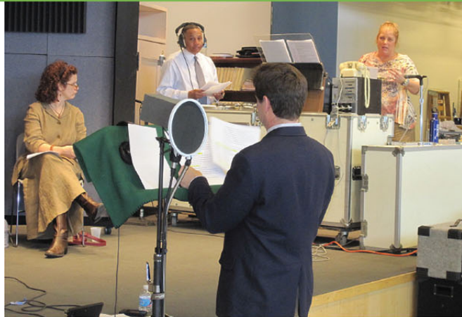
Actors and director producing a live episode.

The action takes place entirely in the audience's mind, theater-of-the-mind, if you will. You are guided only by the voices and sounds that you hear. In this way, the experience is like a book in that it allows us to take part in the imaginative process of creating the story's world. But the story is also told with the power of human voices and all the additional support of sound effects and music to create an intensely emotional and