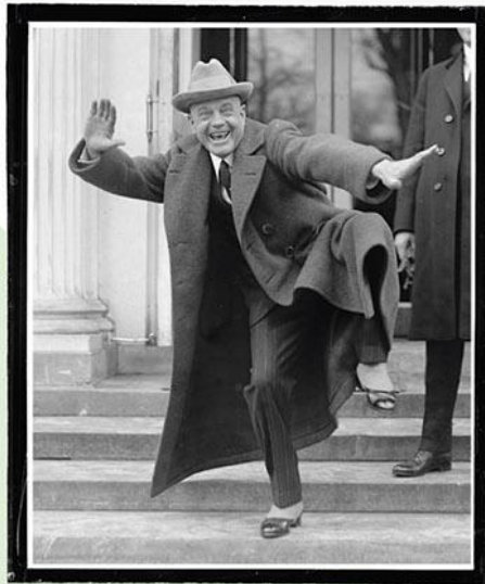
The world-renowned and irrepressible Billy Sunday at the White House.

Ellis, W. T. (1914). “Billy” Sunday: The man and his message . Philadelphia: The John C. Winston