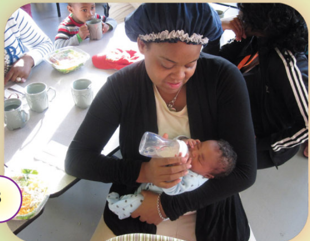
Overnight guest mother with her newborn at the Mothers with Children section of PGM's cafeteria.

Our Bibles are not collecting dust on a shelf, for we are more than overcomes—"Nay, in all these things we are more than conquerors