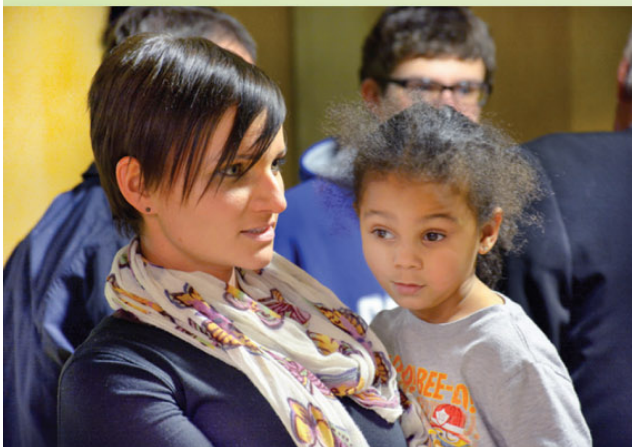
Left—A volunteer holds a child during a Saturday night Gospel service in the PGM auditorium.