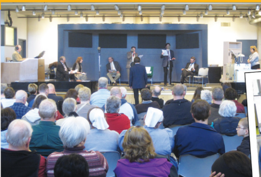
A live "Unshackled!" taping in the auditorium.