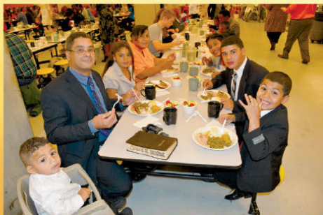
New Day graduate father and his family. Eating a meal together in PGM's cafeteria. His story will be featured in an upcoming newsletter.