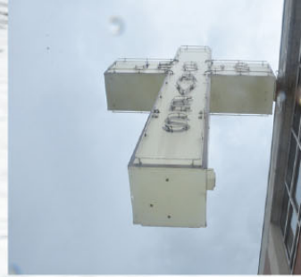
Right: Photo by Stephen Welch of PGM's Cross during the rain storm which inspired this article.