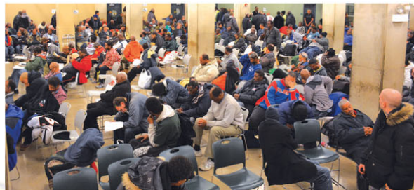
Our day room at PGM is a mission field where the lost can come, hear, and experience the Gospel.

I believe that God has placed us in the heart of a city torn by violence and sin to be a light to those in darkness and to bind up the brokenhearted. Continue to pray for this ministry, and thank you, because your support has made it possible for those in darkness to come here and be given beauty for ashes. If we were not here, where would they go? Thank you.