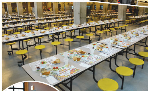
Tables were set with love and blessings to nourish, in our large bright dining room.