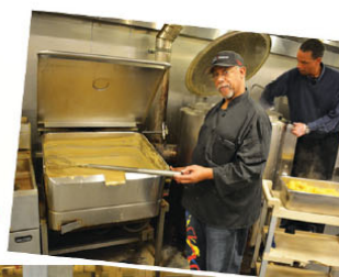
Chefs preparing the meals

We also wanted to thank you for your part of supporting this ministry in faithful prayer and faithful financial support. Without your help, we would not have a nutritive environment for those in need of help to stay planted in and grow to their full potential in Jesus Christ. Thank you for letting us share this story of a life forever changed. May we all continue to demonstrate thankful living this Thanksgiving and beyond.