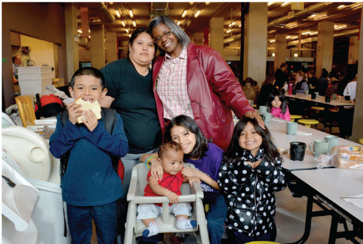
A mother and her children received the food, shelter, and care they needed at Pacific Garden Mission because of your generous support.

When you give this month, know that you are linking arms with many who support this ministry in prayer and giving. As part of this team, you make life transformation possible for the hopeless and homeless who continue to come to us looking for the answers we find in Jesus Christ. Thank you for welcoming them with a hot meal, safe shelter, and the life-changing power of the Gospel.