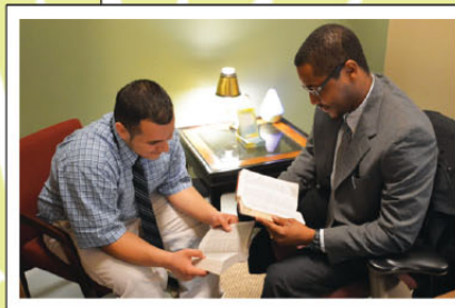
THE NEW DAY PROGRAM: PGM's highly successful ministry of helping people reclaim their lives from the stronghold of addiction through discipline, counseling and Bible study.