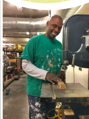
A transformed life. After graduating the New Life Program he has gotten married and is working full time in Maintenance.

a role model and a fully functioning follower of Christ. Imagine how many other people have been changed here at Pacific Garden Mission and the threads of faith they have woven throughout the world now. Only God knows the true impact of this old lighthouse, but through the stories we see here daily, we know God continues to work miracles. May we continue in prayer for all the lost souls that come through our doors.