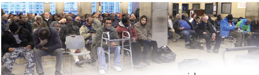
A rest from the storm, the PGM day room, shown here can sometimes be the last hope for many on this earth.