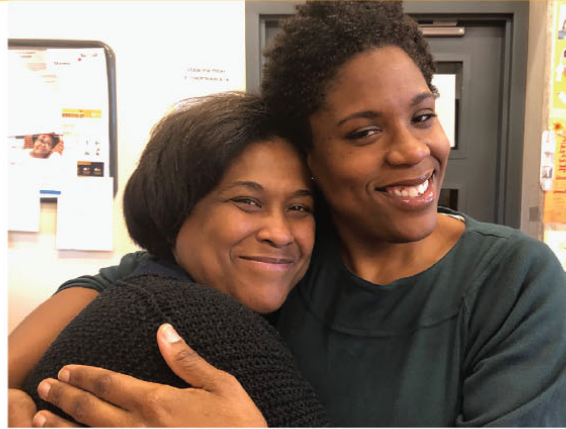
There is a special joy of fellowship among the sisters in Christ at PGM.