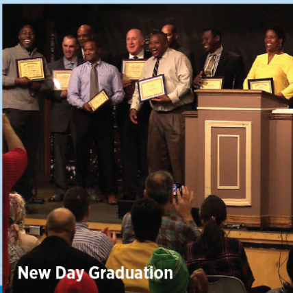
New Day Graduation