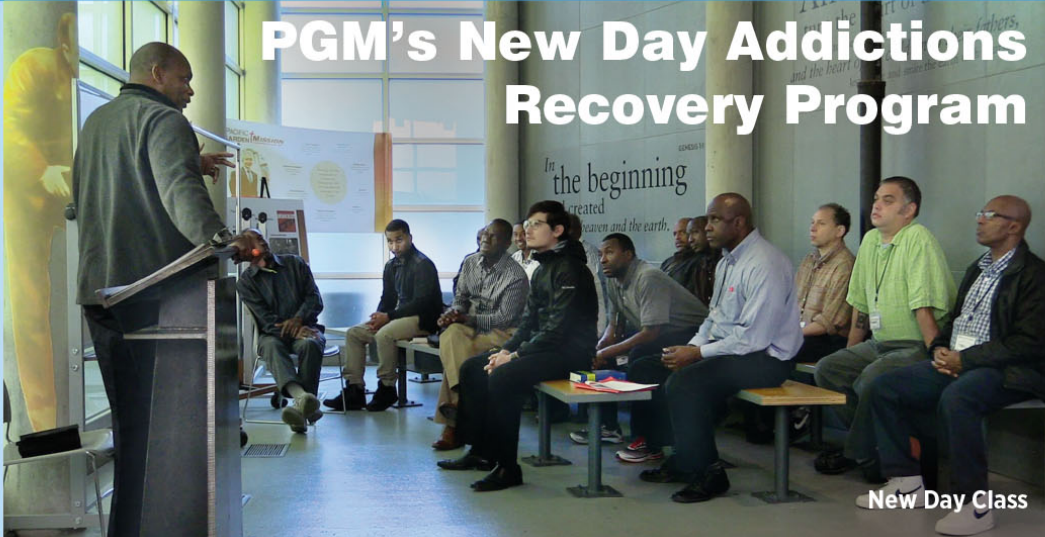
New Day Class

The resources you help provide through Pacific Garden Mission are oftentimes the last available lifelines of love, support, and compassion that the homeless may receive. For those living the lifestyle of addiction, death or insanity is many times not far off, but praise God that transformation and a new life is not far away either. Our 90-day residential addictions recovery treatment program, called New Day, provides meals, dormitory housing, clothing, classes, counseling, and nursing care. We address the root of drug and alcohol addiction by focusing on the Word of God and Christ.