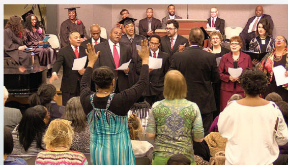
The PGM Choir leads our staff and guests in heartfelt worship

Will you pray about helping us reach more men and women who walk through our doors looking for answers to find Jesus Christ? As you do, we look forward to sharing what God is doing through our joint efforts to advance His Kingdom. Thank you for your faithful support.