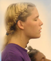
WORSHIP AT PGM: Continued from page 1

Jesus Christ is doing here at Pacific Garden Mission every day. As you read these, you will hear how your faithful support makes this possible, as we build a ministry together to reach the lost with the Gospel of Jesus Christ. Thank you for helping us offer life answers through faith in Jesus Christ, through any season of life, so that our guests become fully functioning followers of Christ.