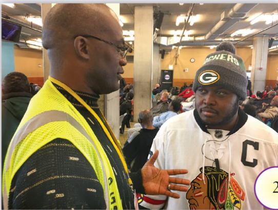
Photo: the employee who requested anonymity is shown here helping a homeless man in PGM's Day Room.