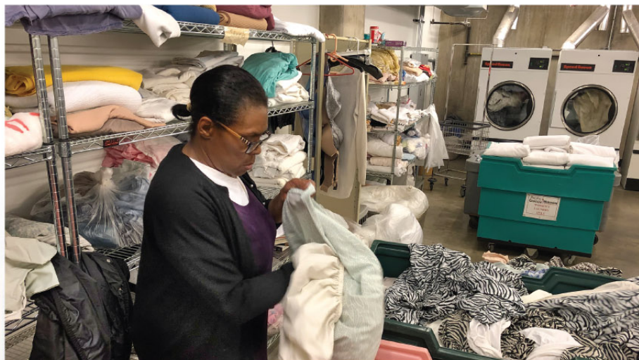
Nova volunteers in the laundry department cleaning the linens for over 150 women staying at PGM

Surely goodness and mercy shall follow me all the days of my life: and